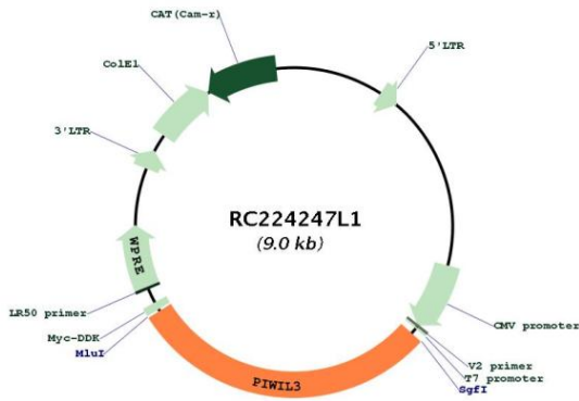
Circular map for RC224247L1