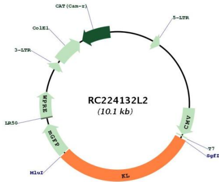
Circular map for RC224132L2