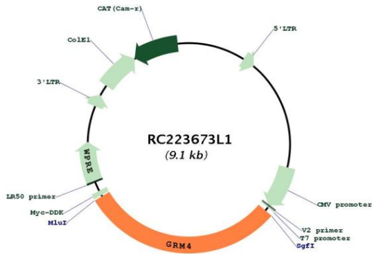
Circular map for RC223673L1