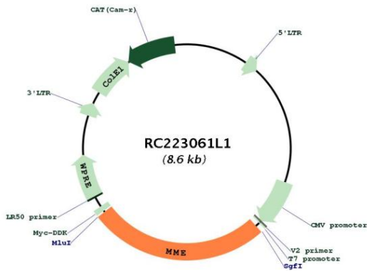
Circular map for RC223061L1