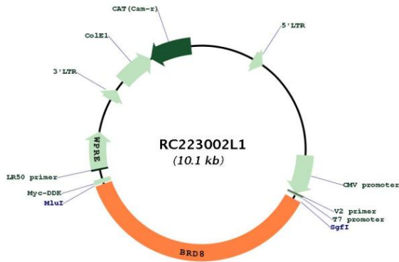
Circular map for RC223002L1