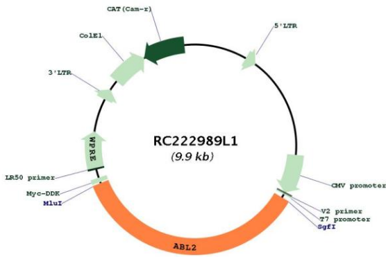
Circular map for RC222989L1