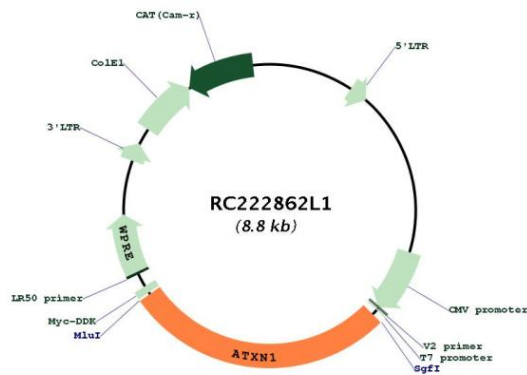
Circular map for RC222862L1