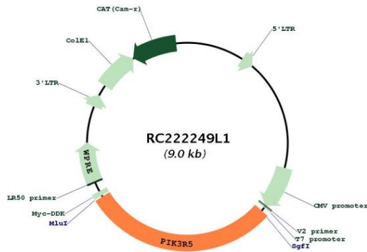
Circular map for RC222249L1