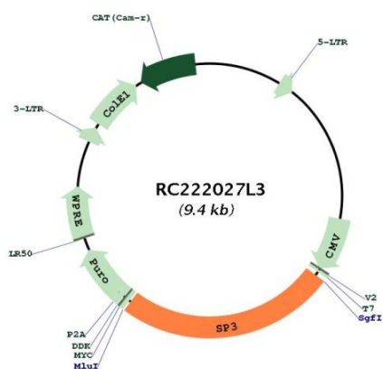
Circular map for RC222027L3