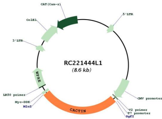
Circular map for RC221444L1