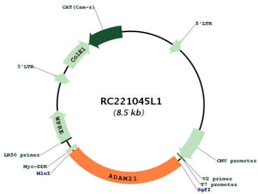
Circular map for RC221045L1