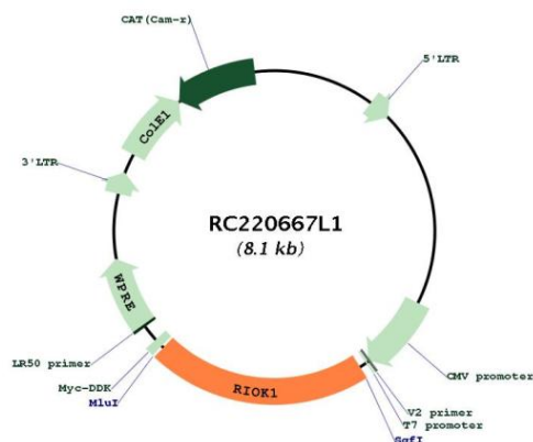
Circular map for RC220667L1