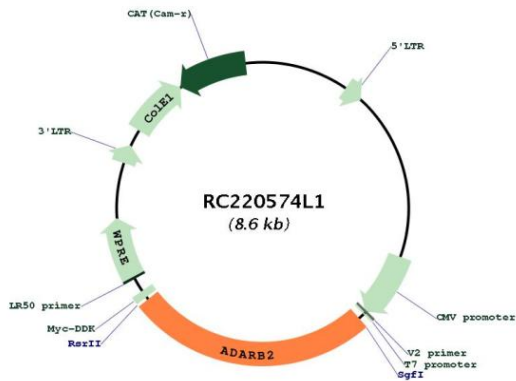
Circular map for RC220574L1