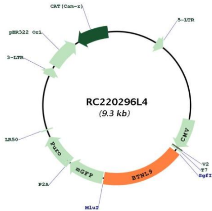
Circular map for RC220296L4