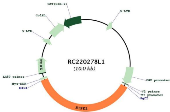
Circular map for RC220278L1