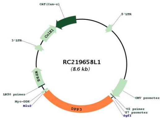
Circular map for RC219658L1