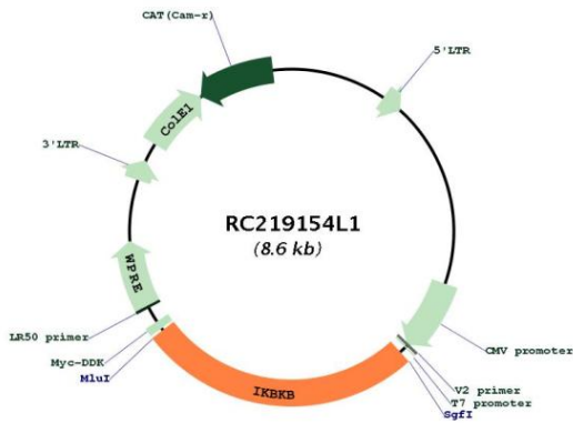
Circular map for RC219154L1