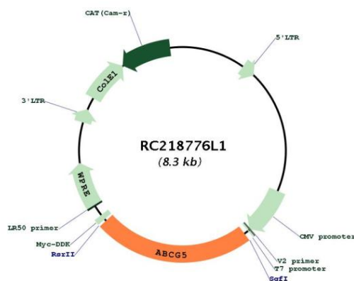
Circular map for RC218776L1