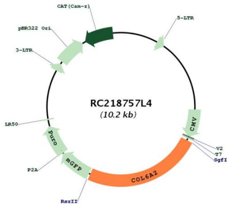
Circular map for RC218757L4