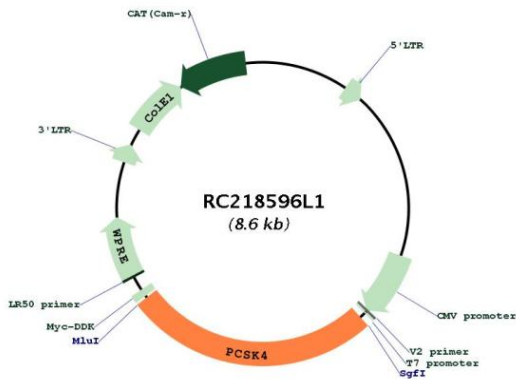
Circular map for RC218596L1