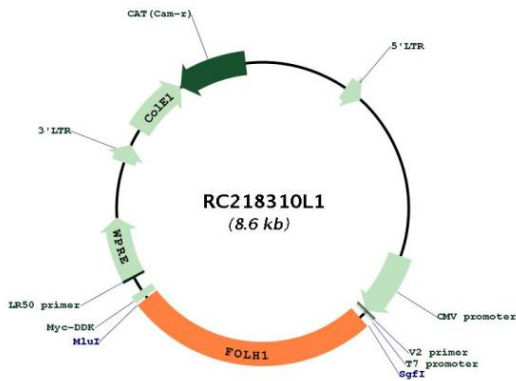
Circular map for RC218310L1