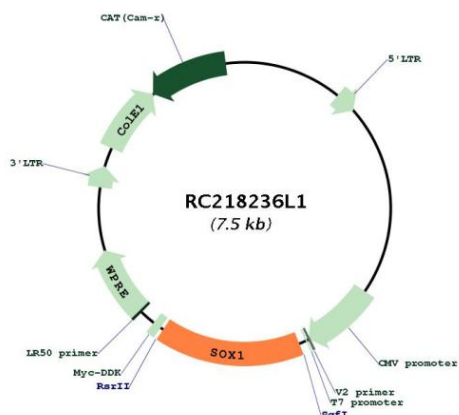
Circular map for RC218236L1