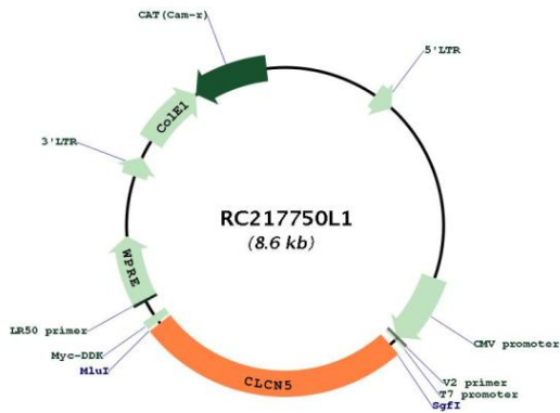
Circular map for RC217750L1