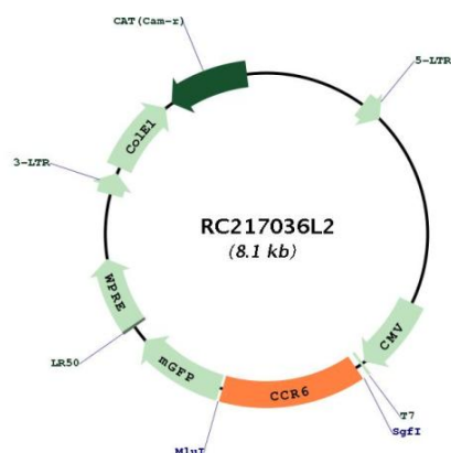
Circular map for RC217036L2