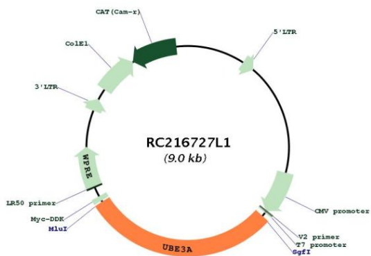
Circular map for RC216727L1