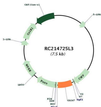
Circular map for RC214725L3