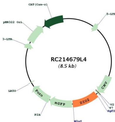
Circular map for RC214679L4