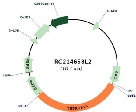
Circular map for RC214658L2