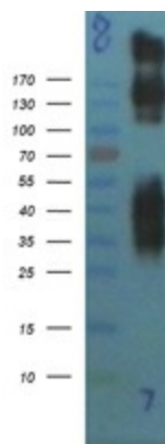
Western blot validation of overexpression lysate (Cat# [LY400304]) using anti-DDK antibody (Cat# [TA50011-100]). Left: Cell lysates from untransfected HEK293T cells; Right: Cell lysates from HEK293T cells transfected with RC214400 using transfection reagent MegaTran 2.0 (Cat# [TT210002]).