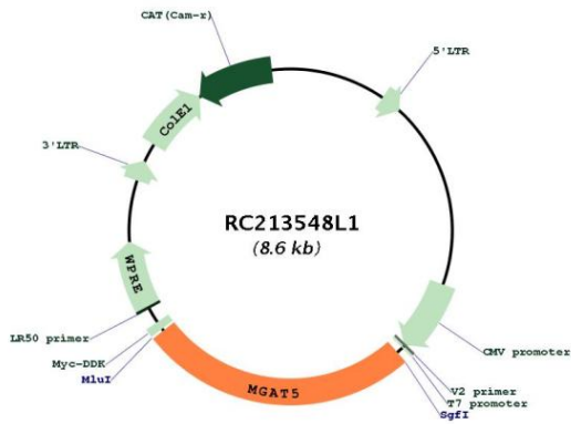
Circular map for RC213548L1