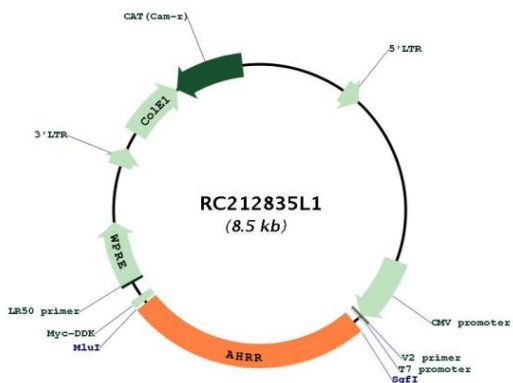
Circular map for RC212835L1