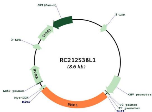
Circular map for RC212538L1