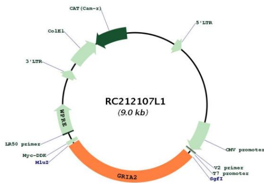
Circular map for RC212107L1