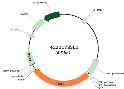
Circular map for RC211785L1