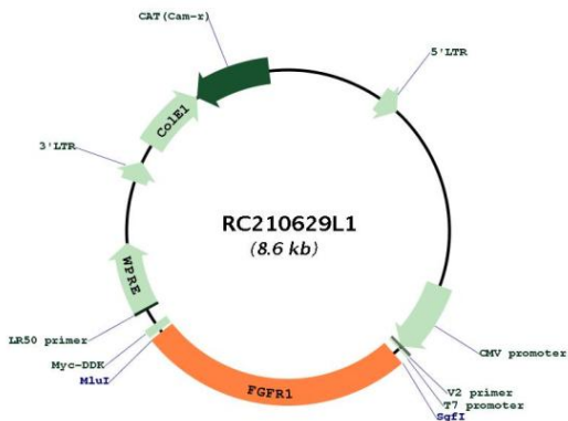
Circular map for RC210629L1