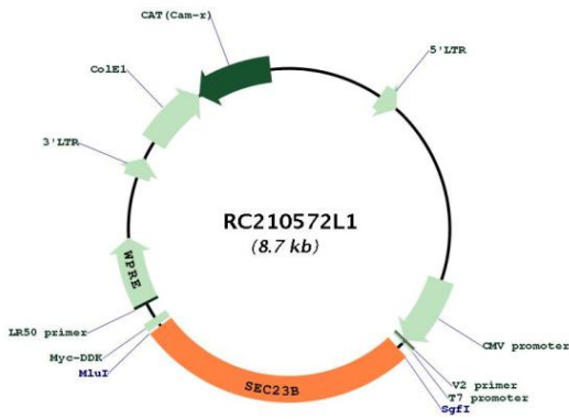
Circular map for RC210572L1