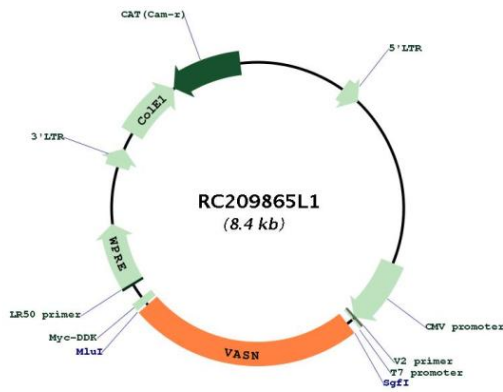
Circular map for RC209865L1