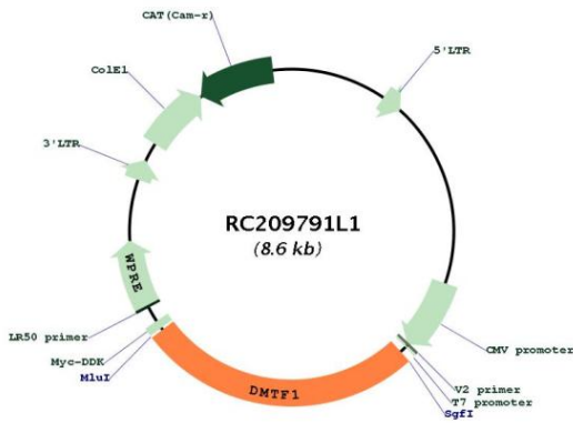
Circular map for RC209791L1