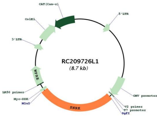
Circular map for RC209726L1