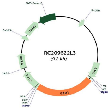
Circular map for RC209622L3