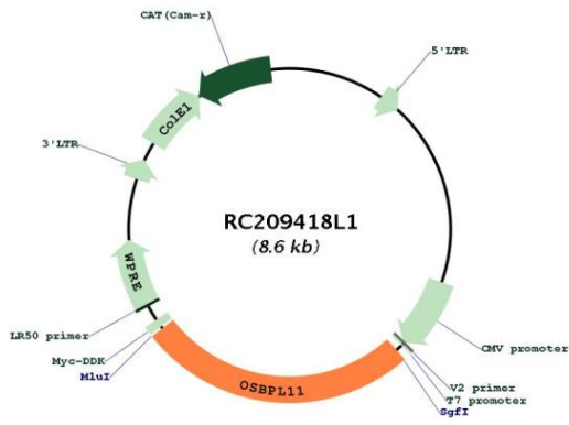
Circular map for RC209418L1