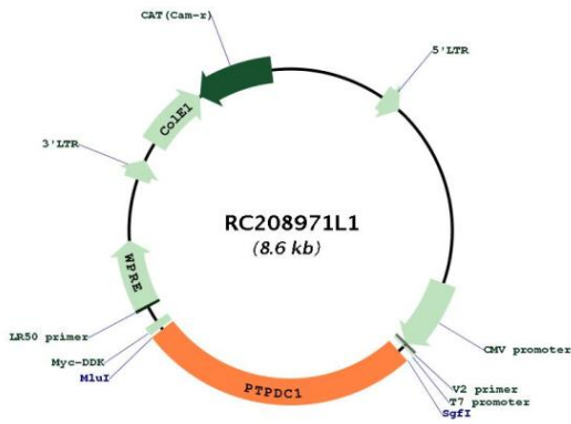
Circular map for RC208971L1