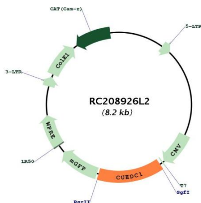
Circular map for RC208926L2