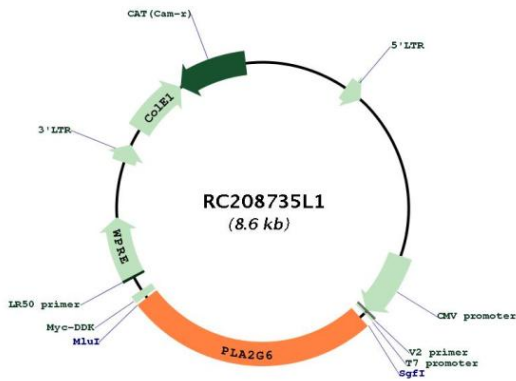
Circular map for RC208735L1