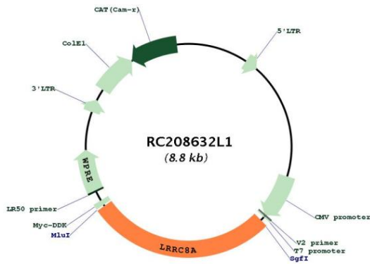
Circular map for RC208632L1