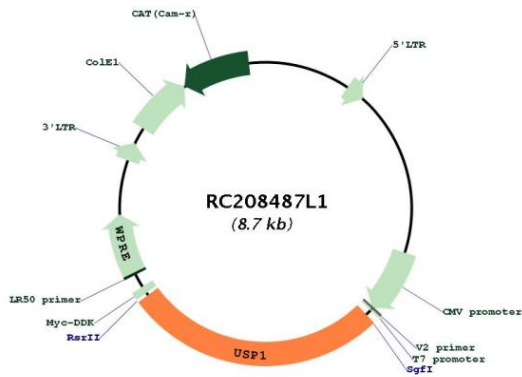
Circular map for RC208487L1