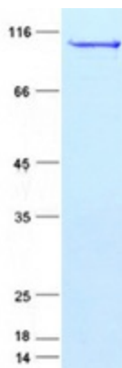
Coomassie blue staining of purified SFPQ protein (Cat# [TP308454]). The protein was produced from HEK293T cells transfected with SFPQ cDNA clone (Cat# RC208454) using MegaTran 2.0 (Cat# [TT210002]).