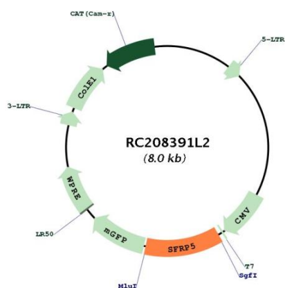
Circular map for RC208391L2