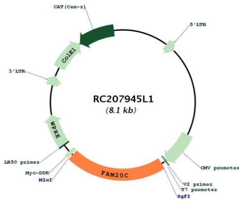
Circular map for RC207945L1