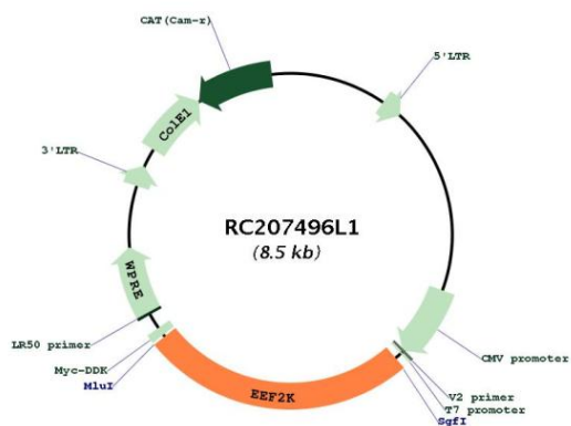
Circular map for RC207496L1